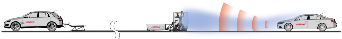
Fig. 2: Test situation: SprayMaker assembled on common vehicle target (Euro NCAP vehicle)